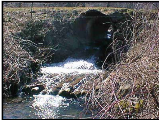
Above: A view of the current culvert and log barrier on Hampton Creek looking up stream. Below: OMTU Board Member Bob Fondry stands on the farm access road which crosses the culvert.