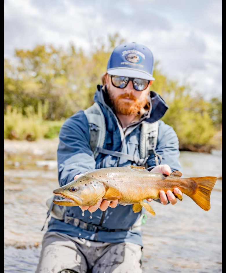
PRESENTATION BY THE FLY BOX