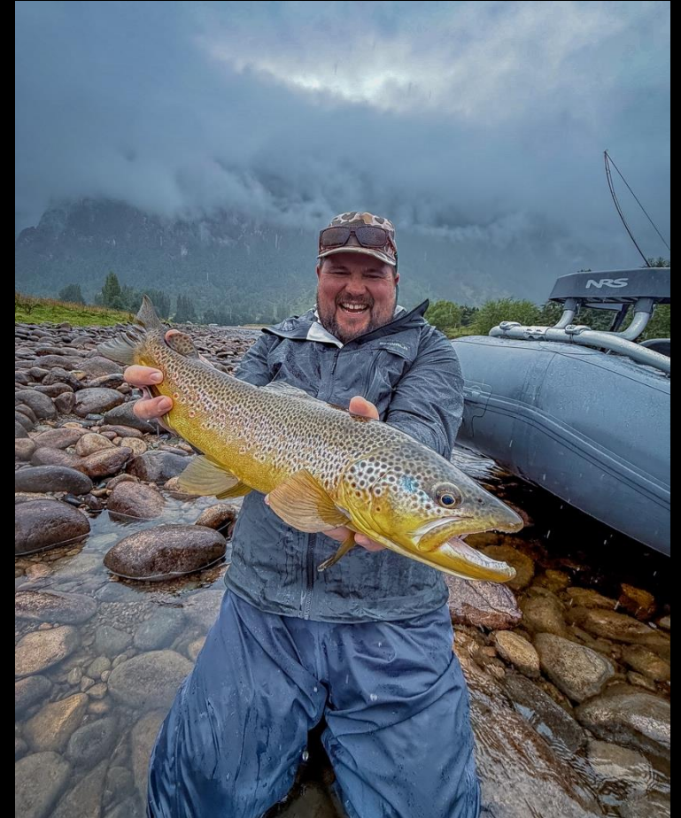
PRESENTATION BY THE FLY BOX