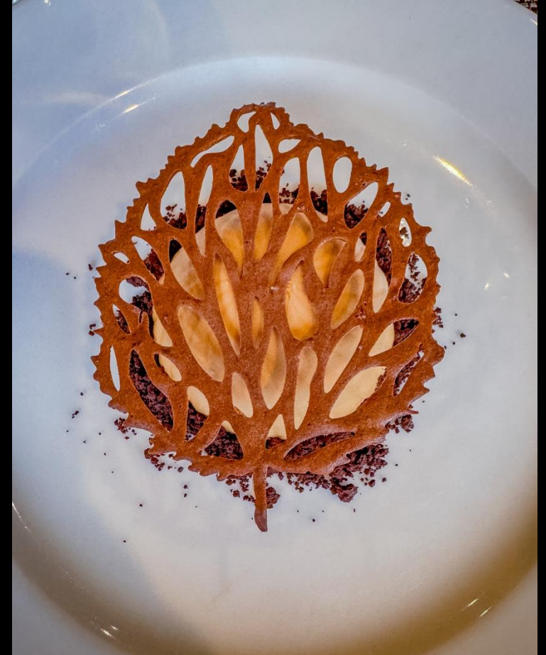
PRESENTATION BY THE FLY BOX