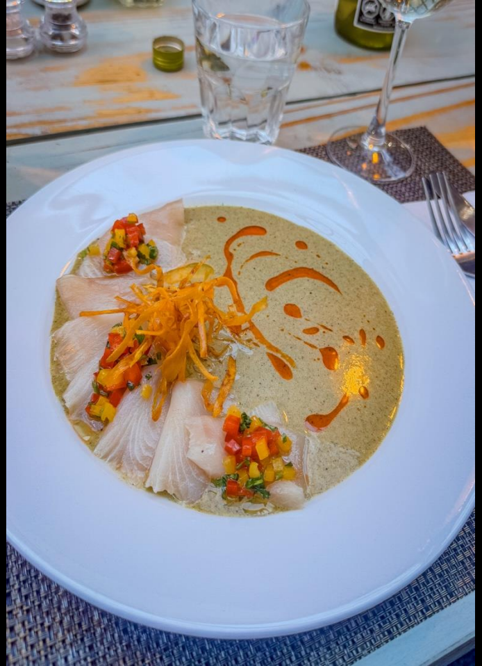
PRESENTATION BY THE FLY BOX